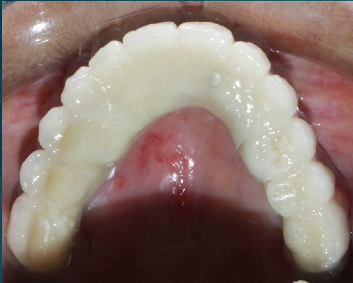
Final Prosthesis In Upper & Lower Arches