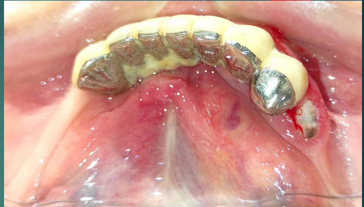
Pre – op Upper & Lower Arches